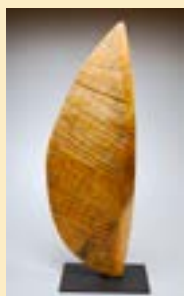
13 BRUCE MITCHELL Wood Sculpture 11 Sherwood Road Inverness CA [415] 847-1145 bruceMITCHELLstudios.com