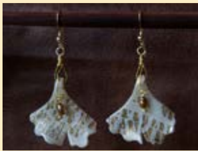
3 KATHY HUNTING Polymer Clay & Beaded Jewelry 11 Ridge View Lane Point Reyes Station CA [415] 873-6009 earlybirdbeads.com