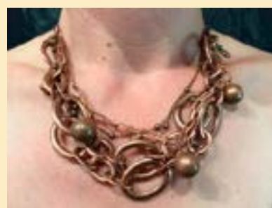
14 SHARI MILNER Hand Crafted Jewelry 11 Sherwood Road Inverness CA [415] 246-1225 sharimilnerdesigns.com