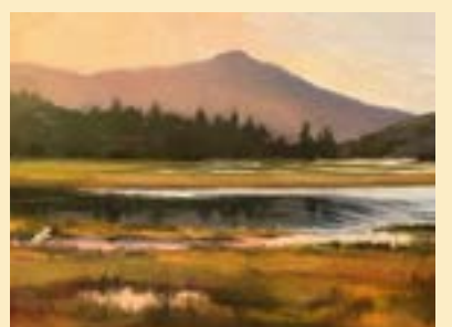
15 ELAINE WEST Oil Paintings & Prints 5 Inverness Way (at First Valley Inverness Gallery) Inverness CA elaineweststudio.com