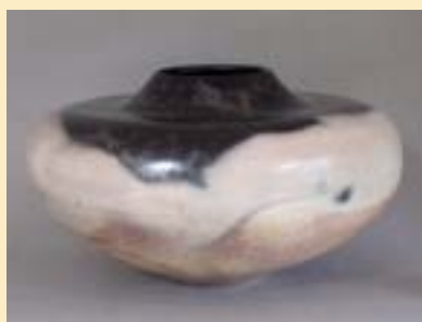
18 MOLLY PRIER Pottery & Pueblo Style Vessels 41 Cameron Street Inverness CA [415] 669-7337 carolmollyprier.com