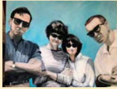
4 CHRISTINA L DESSER Oil Painting 45 Knob Hill Road Point Reyes Station CA [415] 314-0212 cdesser.com