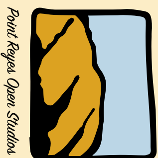
Point Reyes Open Studios