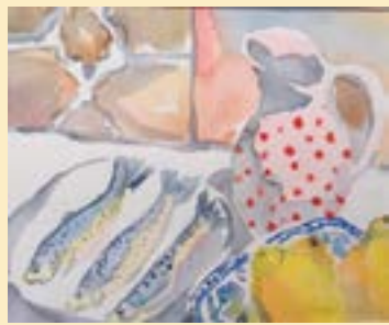
7 LAURIE CURTIS Watercolors & Clay 11030A Hwy 1 (behind Vet) Point Reyes Station CA [415] 663-8724 lauriecurtis.net